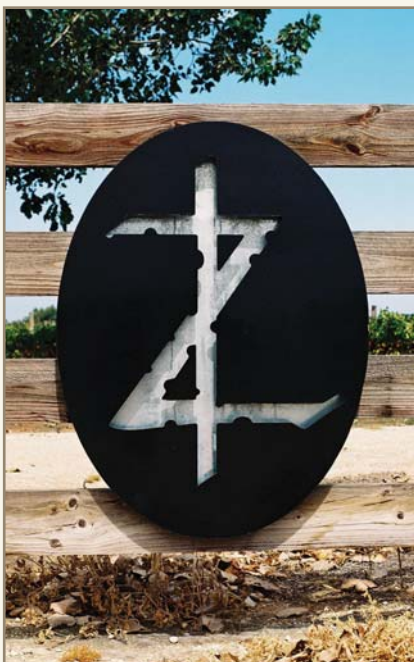
Z marks the spot – the entrance to Zonte's Footstep