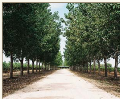
A tree-lined driveway leads visitors to the winery