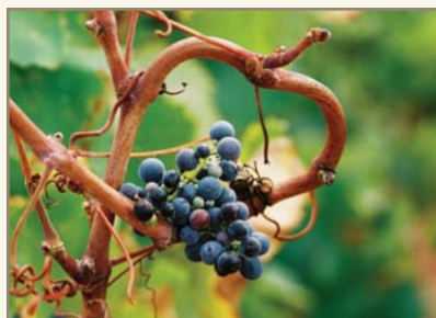
Vines thrive on the region's ancient alluvial soils