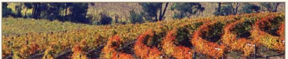
The north-facing site that protects the Yarra Yering vines from spring frost so common in the Valley