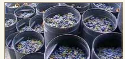
Hand-picked Merlot sits in buckets waiting for the crusher