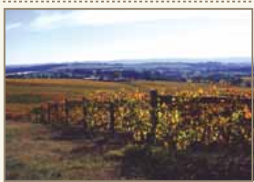
The view across Yarra Yering's 35 y/o Cabernet block