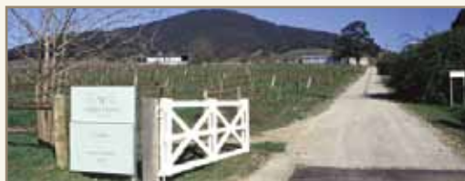
Yarra Yering's homestead and tasting room, est 1969