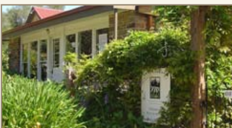
A circa 1860's cottage houses the inviting tasting room