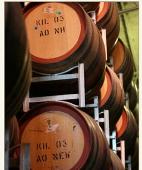
Judicious use of quality oak is Kevin's mandate