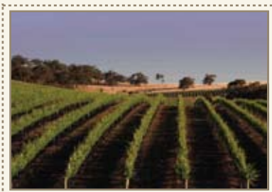
The rolling hills of picturesque Clare