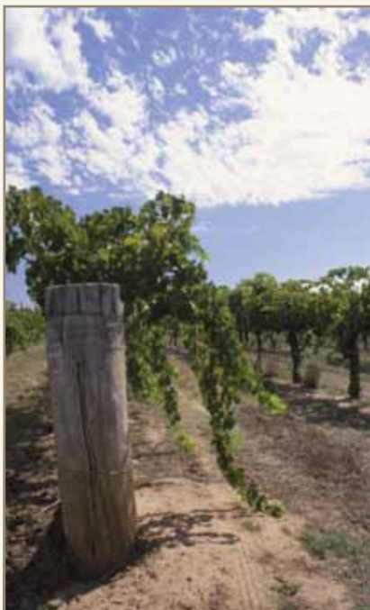
Shiraz vines thrive under the wide blue sky

Fruit grown in this dry, inland Australian region has a character all of its own; a character that set Balgownie apart in the 1970s and re-established Bendigo as a viable wine producing area after the phylloxera devastation of the late 1890s. Such personality is fiercely guarded in the Balgownie winery where fruit is handled gently in order to protect the delicate flavors and preserve typicity. Avoiding gratuitous use of new oak and excessive manipulation in the winery allows the quality of the fruit to speak for itself. Extended maceration bestows fine, delicate tannins to balance the concentrated fruit flavors. This intuitive and insightful winemaking sees Ansted create regional benchmarks of concentration, longevity and a grace belying their power.