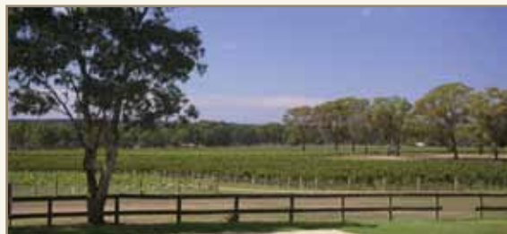
The shade of a gum tree invites in this warm, continental climate