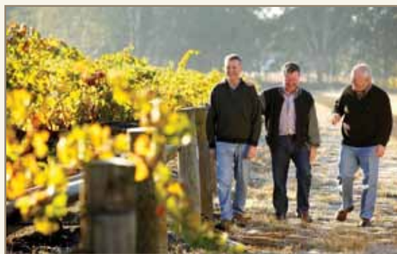
Balgownie proprietors stroll through the dry-grown vineyards