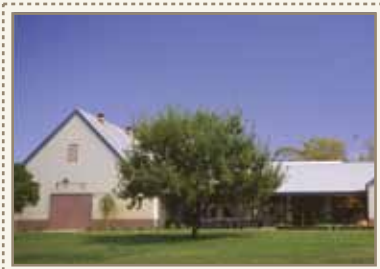
Balgownie's tasting and barrel room in central Bendigo